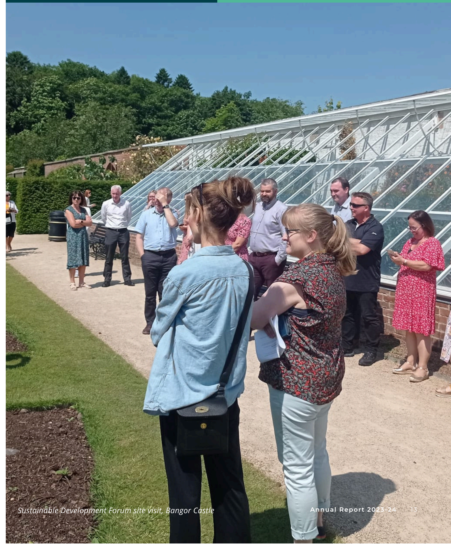
Sustainable Development Forum site visit, Bangor Castle