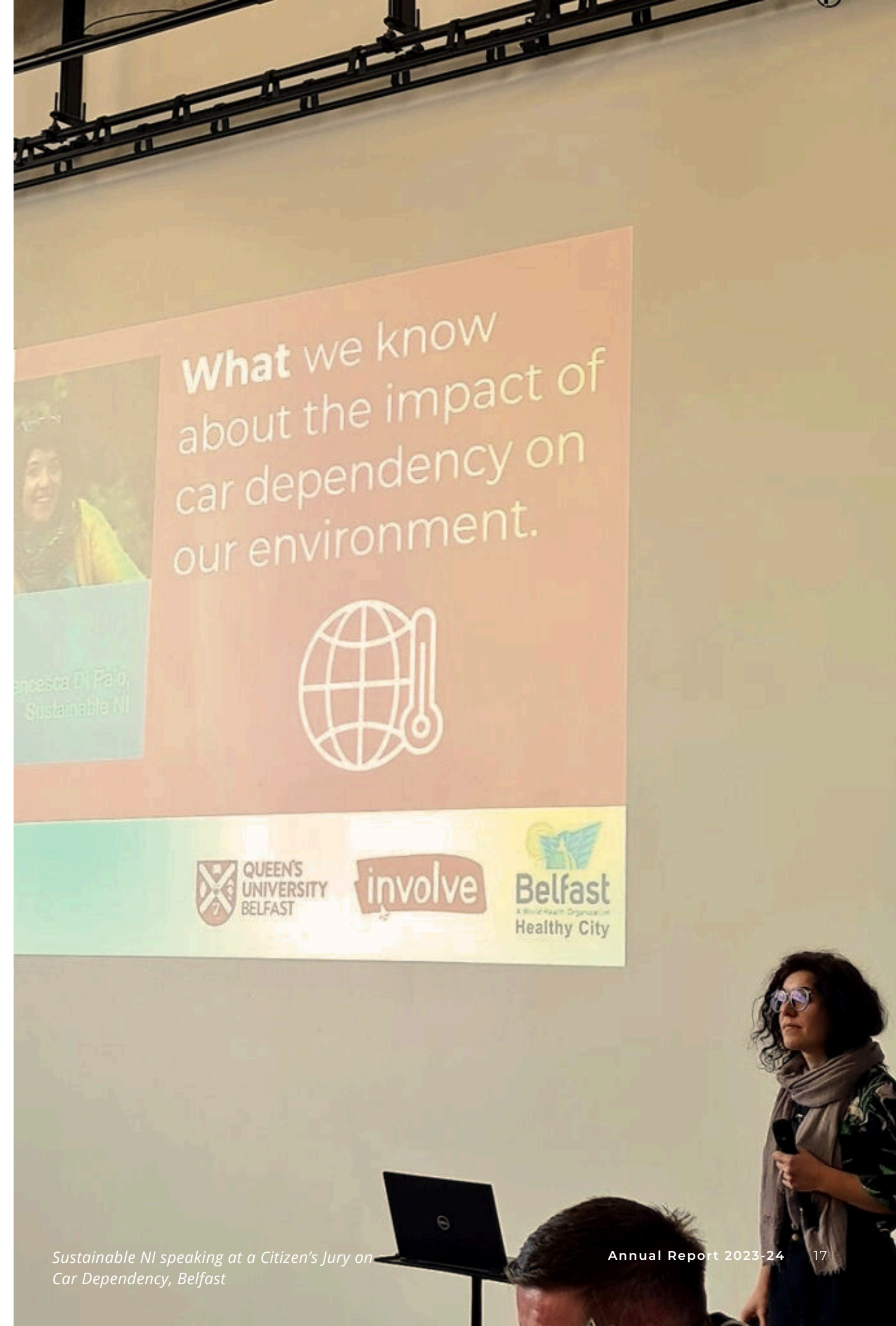
Sustainable NI speaking at a Citizen's Jury on Car Dependency, Belfast

We led a Needs Analysis Workshop on 23 November in the Burnavon Arts and Cultural Centre bringing sustainability officers from across Northern Ireland together to understand what is needed strategically for local authorities to fully integrate sustainability and climate action into governance, management and delivery at the local level. The session highlighted policy and skills gaps and how Sustainable NI can better support councils going forward.